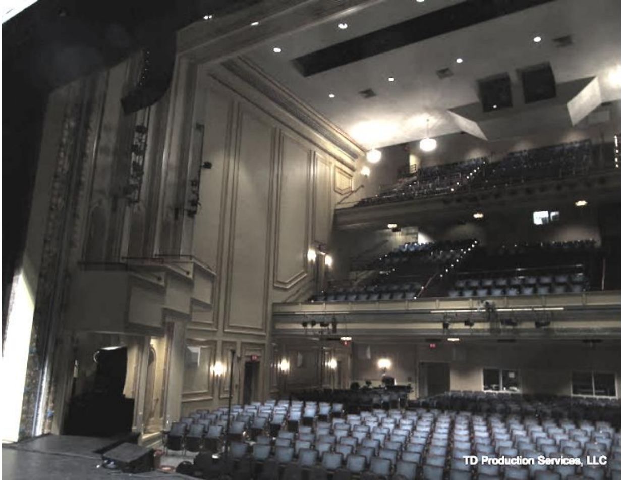
From center stage