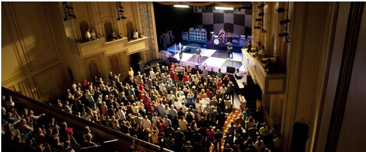
From top of second Balcony